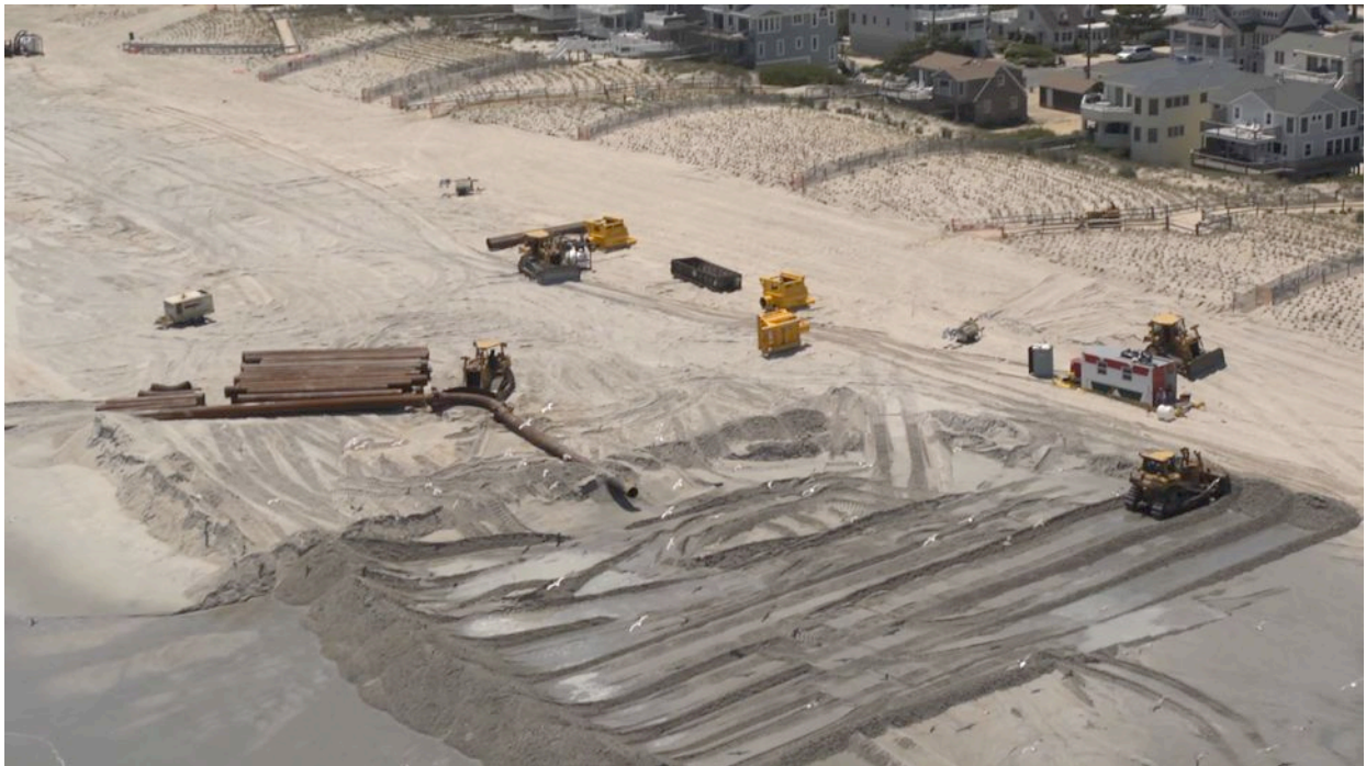
Army Corps Beach Replenishment Project, Beach Haven, Long Beach Island