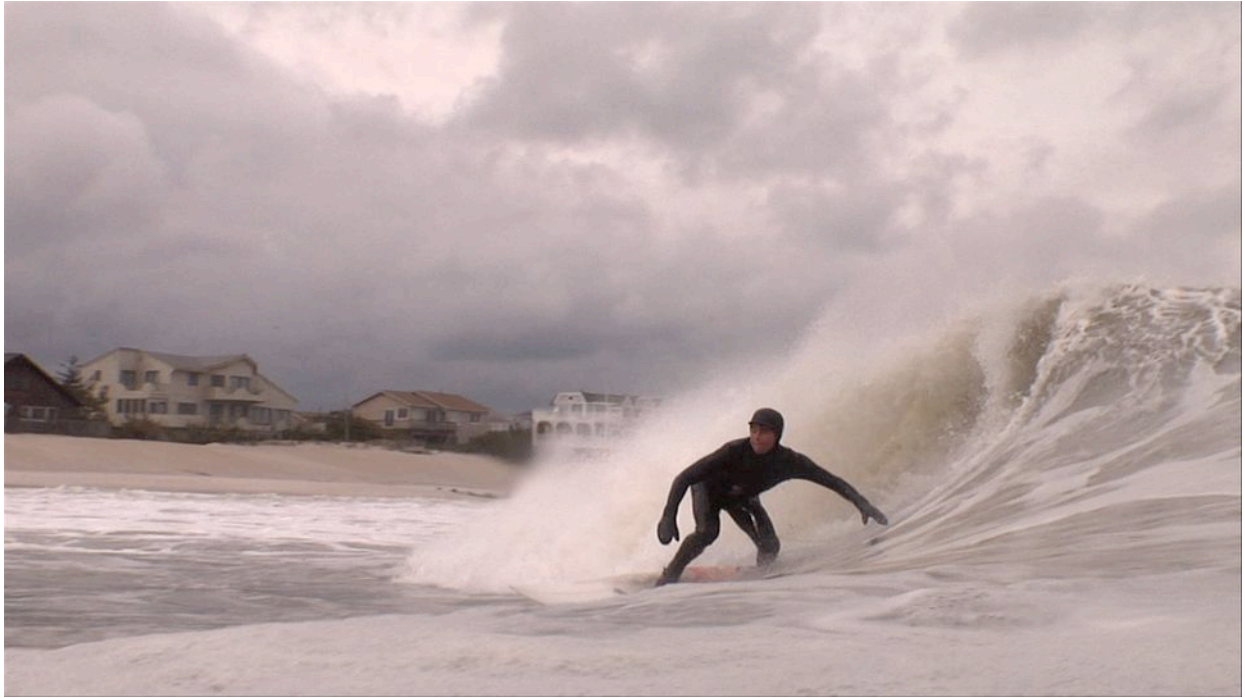
Surfing at Harvey Cedars, Long Beach Island