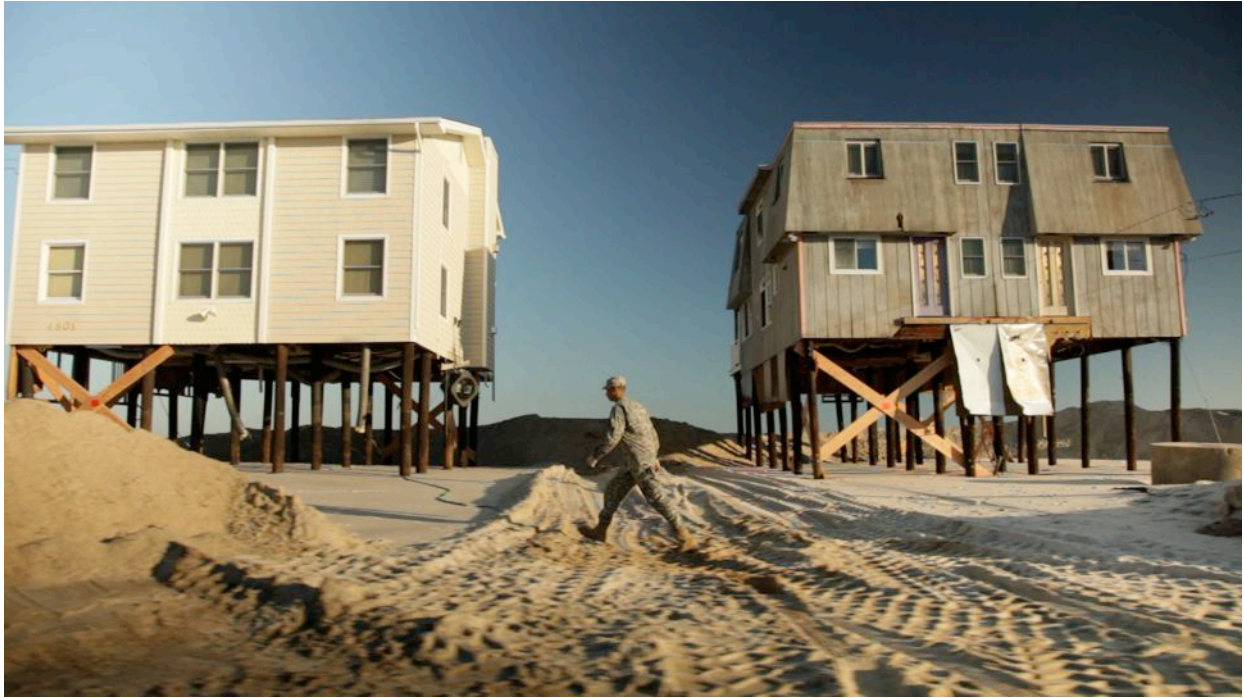
Holgate, Long Beach Island, Post-Sandy